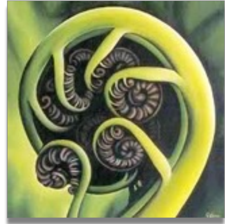
Little by little the fern unfurls the parts she once hid to the world (author unknown)

Over the course of the year , students read books and articles, view life-changing documentaries, engage monthly in a variety of soul-forming activities, develop a spiritual community with a small group of co-learners, and experience teaching and formational activities built around time-tested concepts. A blend of intellect and experience, individual and community, social justice and contemplation, the program is deeply centered on Christ and rooted in the Gospel. The robust curriculum helps students become more open, receptive and responsive to God's transforming grace in their lives.