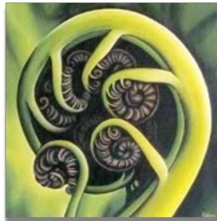
Little by little the fern unfurls the parts she once hid to the world (author unknown)

Over the course of the year , students read books and articles, view life-changing documentaries, engage monthly in a variety of soul-forming activities, develop a spiritual community with a small group of co-learners, and experience five two-day retreats of teaching and formational activities built around time-tested concepts. A blend of intellect and experience, of individual and community, of social justice and contemplation, the program is deeply centered on Christ and rooted in the Gospel. The robust curriculum helps students become more open, receptive and responsive to God's transforming grace in their lives.