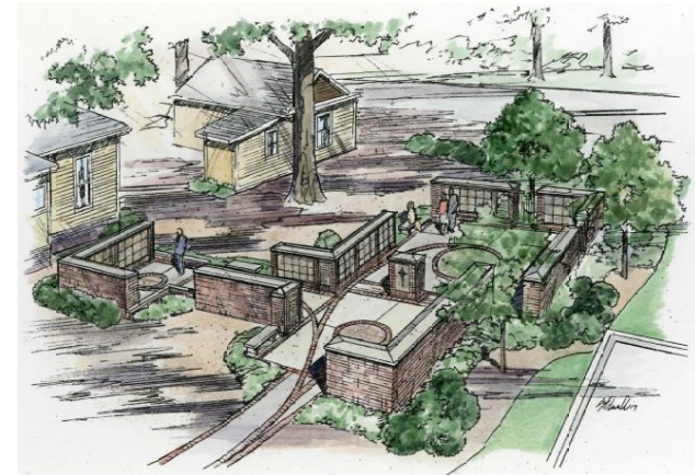
Conceptual Rendering by Columbarium Planners, Inc.